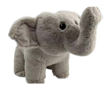
Giant Elephant Plush (1 winner)