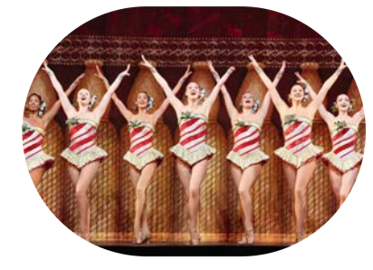
2 Tickets to Radio City Christmas Spectacular November 2024 (2 winners)